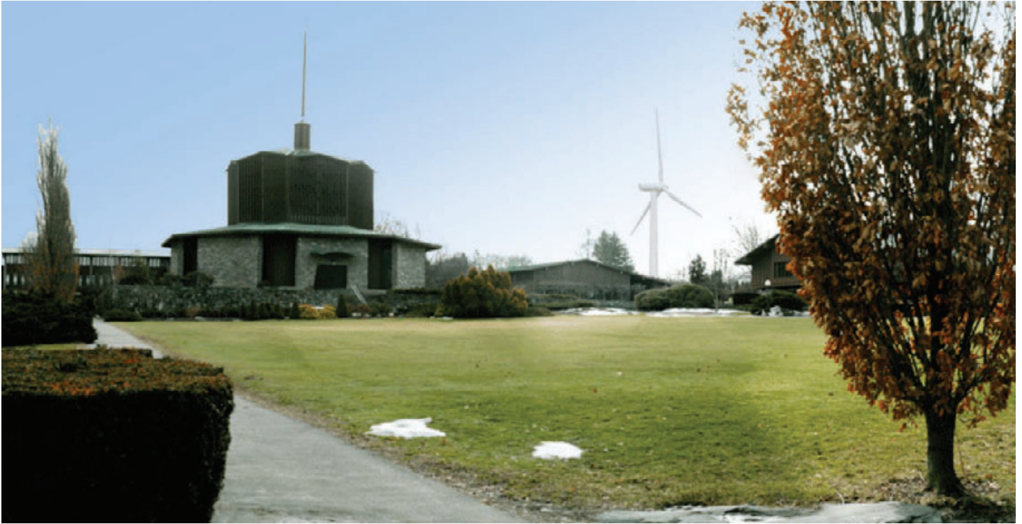
Photo simulation of Vestas V47 viewed from the center of campus, Holy Lawn, Portsmouth Abbey School, Portsmouth, RI.

renewable energy source was a good idea. It made sense economically. The questions were: How big? What does it look like? Where will we put it? It is a very big thing and will undoubtedly dominate the landscape. It will be set back about 1000 feet from the closest neighbors on Cory's Lane, almost directly behind the Monastery and the Church. Right from the very beginning we talked with our neighbors and others in the town to get their input. The response was overwhelmingly positive. We're putting it on a beautiful property, and we have an obvious sensitivity to aesthetics. Our hope is that if we are willing to put something this big on that property, it may quell the NIMBY arguments against wind power. We have a hockey rink on the campus, with a lot of people going in and out, so the turbine will be a real showcase. It will also be like a giant weather station, with interesting educational applications... we can tap into the data feed from the turbine 24 hours a day, and we can make that available to other schools as well.