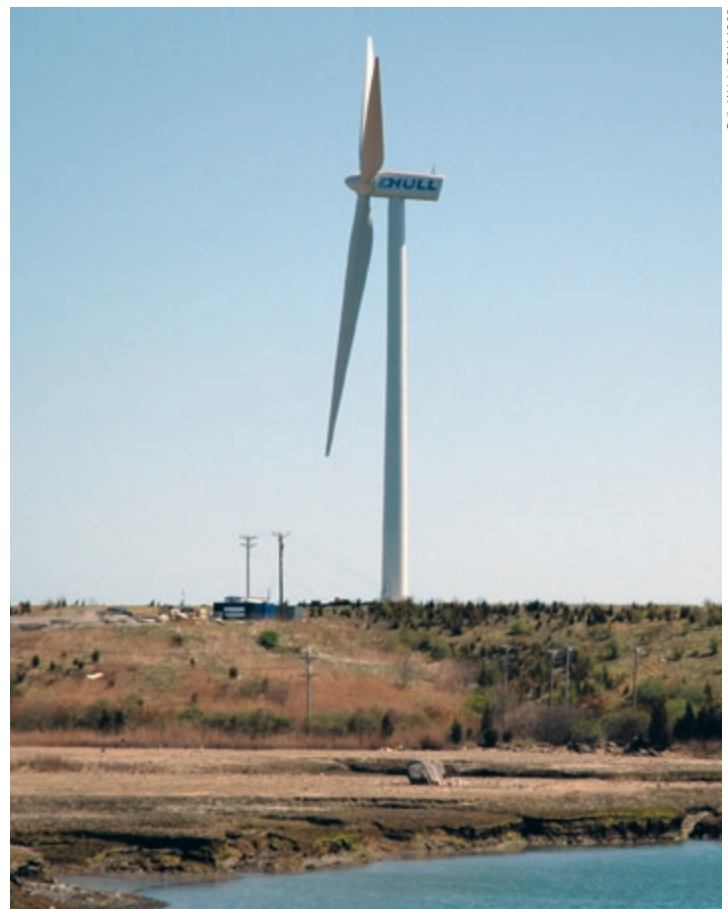
Hull 2 is the largest wind turbine in New England and the first U.S. installation on a capped landfill.

In 1998, we first started exploring the turbine options that ultimately led to Hull 1. We tried to establish a process that revolved