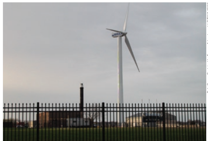
Massachusetts Maritime Academy's Vestas V-47 overlooks the school's football and baseball fields.

The saga of the Cape Wind Project , a 130-turbine, 450-MW project proposed by Energy Management Inc. for Nantucket Sound, continues. In June, legislators agreed to remove a provision from the Coast Guard funding bill that would have