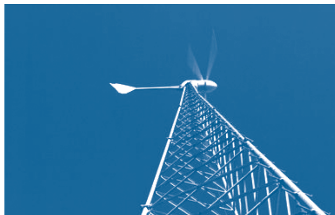
Small wind turbines like this 10-kW Bergy XL.10 can provide electricity for homes, farms, and ranches.

Since January 2004, TAP has responded to 41 requests related to wind power in 24 states.