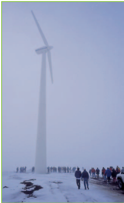
Commissioning and blessing of the St. Paul power plant.

was completely replaced, the power system has operated well over the past 7 years. In 2004, for example, the wind turbine had a non-scheduled availability of 100% and a capacity factor of more than 40%.